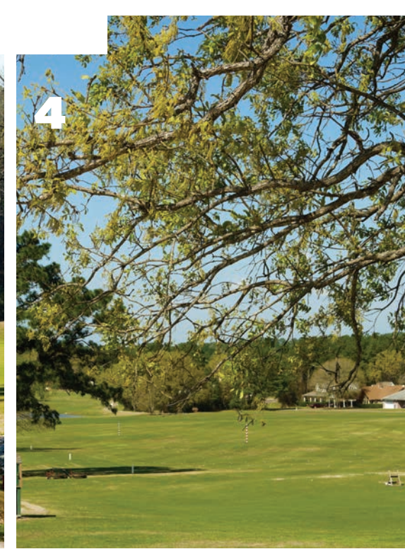
Twitter: @SamHoustonEC • Facebook.com/SamHoustonEC